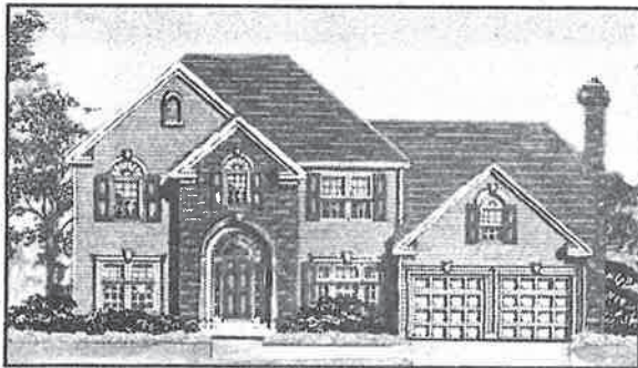
The Ashford Grand

T here are many appealing reasons to move up to the Ashford. Space! Drama! Custom class features! Distinctive styling! It all begins in the impressive two story foyer with a grand staircase and balcony overlook. A private study is another welcome addition. Other first floor bonuses are 9' ceilings, spacious kitchen with island counter and a huge family room featuring a soaring two story ceiling. Highlighting the second floor is a grand bedroom suite including double door entrance, an immense closet and a lavish, private bath with double bowl sink and garden tub. Count up the reasons and you'll be convinced. The Ashford has everything you want in a move-up residence.